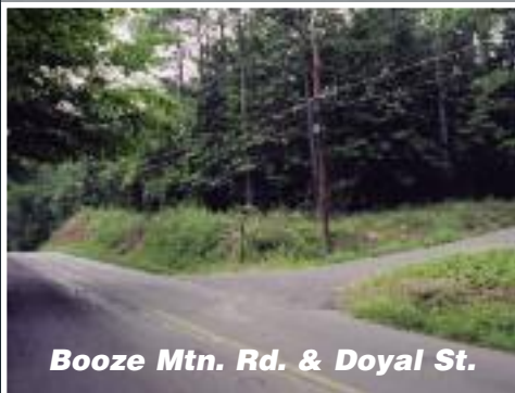
Booze Mtn. Rd. & Doyal St.