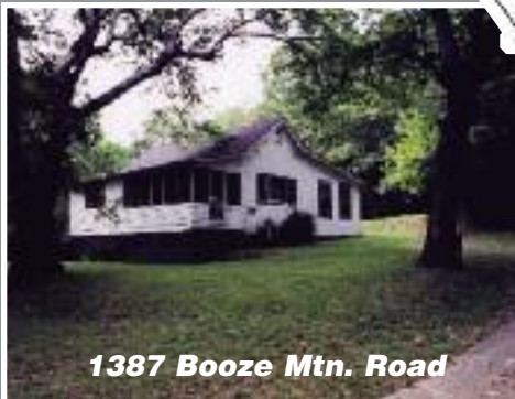
1387 Booze Mtn. Road